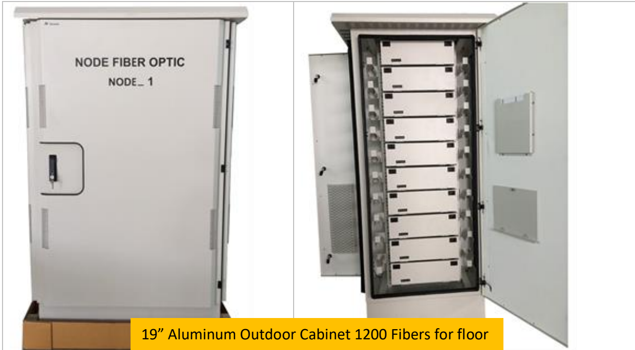
19" Aluminum Outdoor Cabinet 1200 Fibers for floor