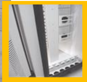
19" Aluminum Outdoor Cabinet 840 Fiber on pole