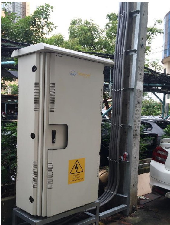
19" Aluminum Outdoor Cabinet 1200 Fibers for floor