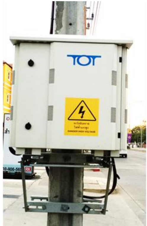
19" Aluminum Outdoor Cabinet 288 - 540 Fibers on pole