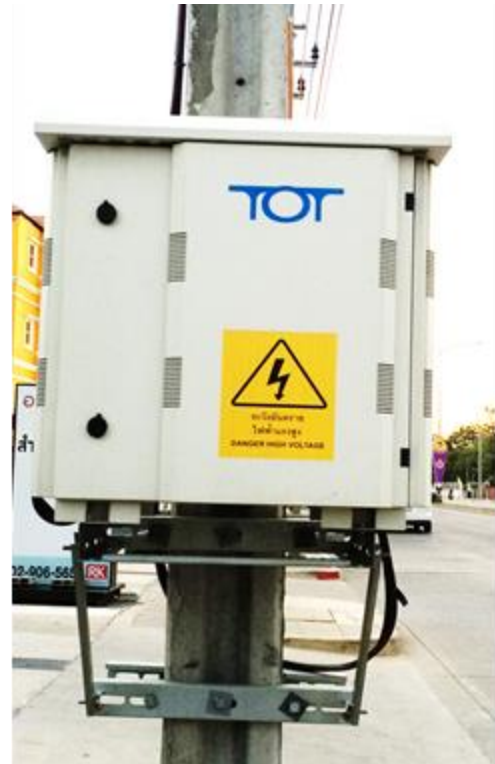
19" Aluminum Outdoor Cabinet 288 - 540 Fibers on pole