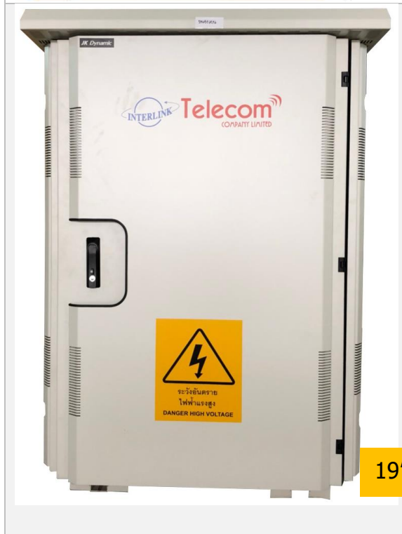
19" Aluminum Outdoor Cabinet D